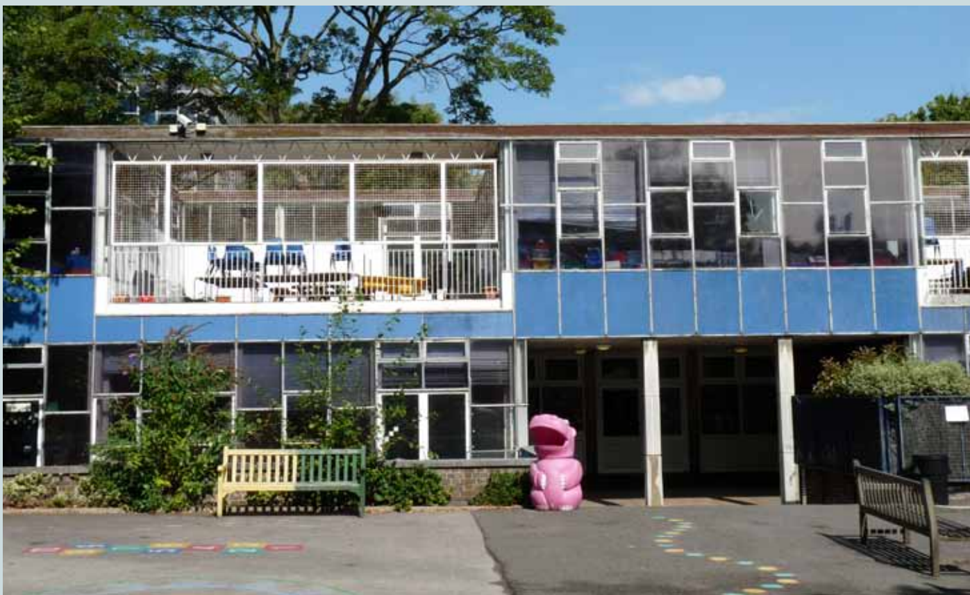
The rear of the school viewed from the existing playground