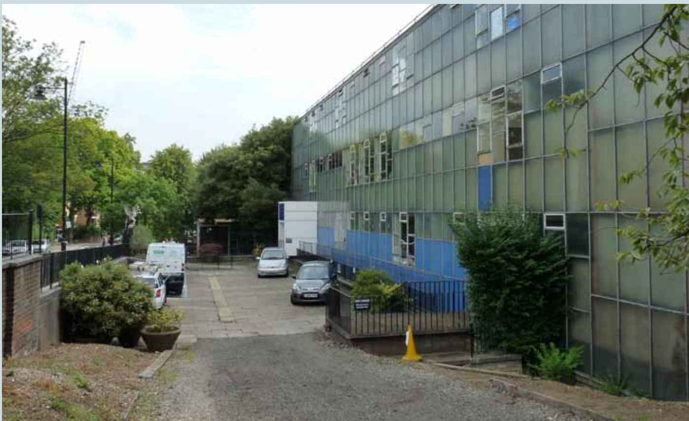
The front of the school and space between the school and Hornsey Lane